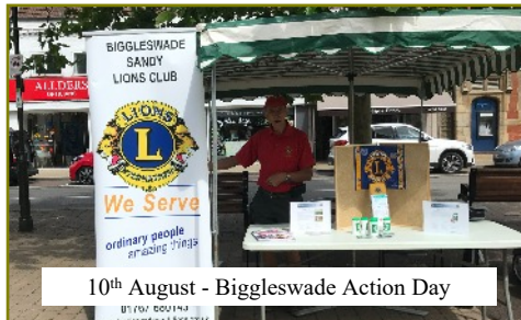
10 th August - Biggleswade Action Day