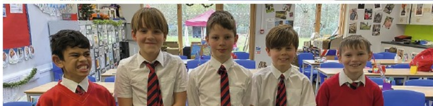
WONERISH SHAMLEY GREEN PRIMARY SCHOOL