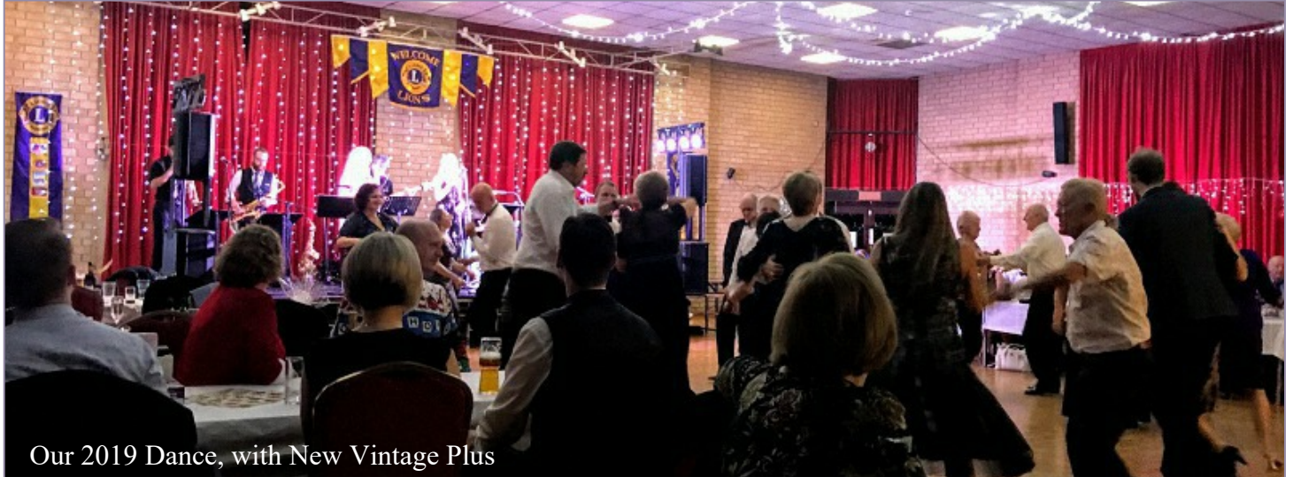
Our 2019 Dance, with New Vintage Plus

We have been running this popular Ballroom Dance for well over 25 years