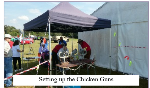
Setting up the Chicken Guns