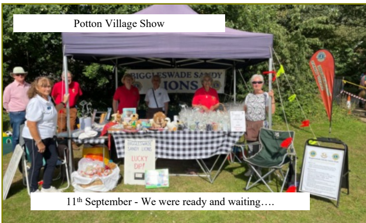
Potton Village Show