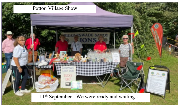
Potton Village Show