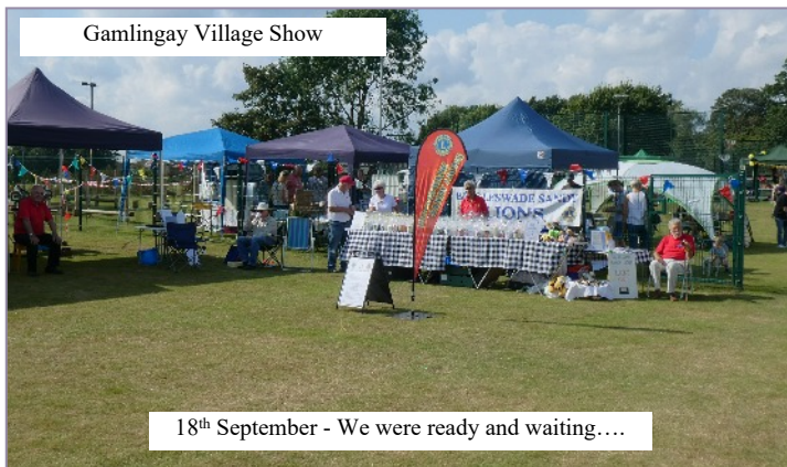
Gamlingay Village Show