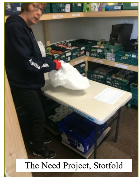
The Need Project, Stotfold