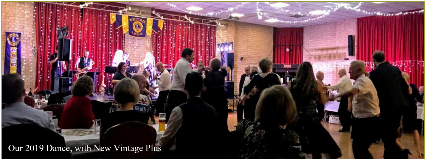
Our 2019 Dance, with New Vintage Plus

We have been running this popular Ballroom Dance for well over 25 years