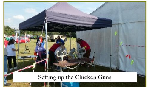
Setting up the Chicken Guns