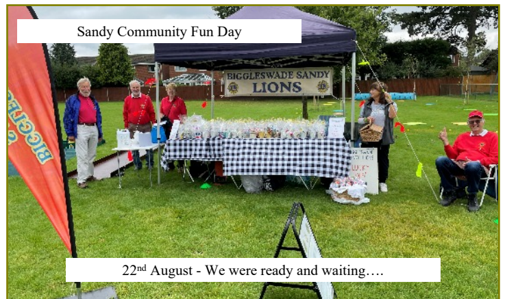
Sandy Community Fun Day