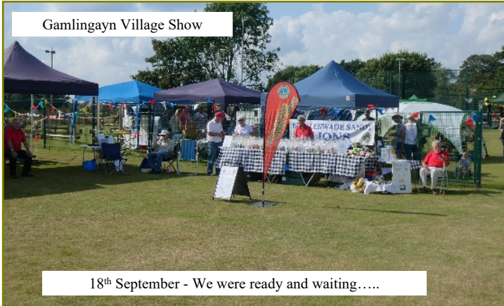
Gamlingayn Village Show