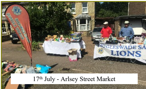
17 th July - Arlsey Street Market

Our summer season didn't really start until the 22 nd August when the Sandy Community Fun Day reminded us of the pleasures normally associated with an English Summer Show. Potton continued the theme and yesterday, 18 th September we ended our 2021 Summer Fête season in glorious style at Gamlingay when our famous chickens joined Duxford with their Flying Display and yes, one of our talented competitors landed his chicken in the basket and left with his £10 prize money. We're now preparing for our Dance on November 27 th and our Christmas Activities through December