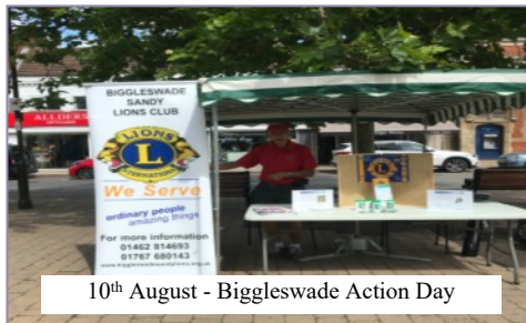
10 th August - Biggleswade Action Day