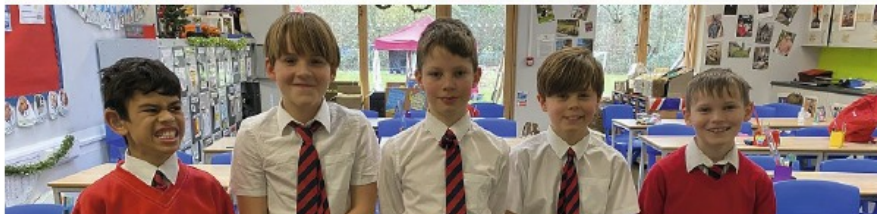
WONERSH SHAMLEY GREEN PRIMARY SCHOOL