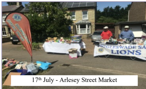
17 th July - Arlesey Street Market

Our summer season didn't really start until the 22 nd August when the Sandy Community Fun Day reminded us of the pleasures normally associated with an English Summer Show. Potton continued the theme and yesterday, 18 th September we ended our 2021 Summer Fête season in glorious style at Gamlingay when our famous chickens joined Duxford with their Flying Display and yes, one of our talented competitors landed his chicken in the basket and left with his £10 prize money. We're now preparing for our Dance on November 27 th and our Christmas Activities through December