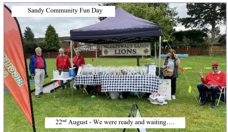
Sandy Community Fun Day